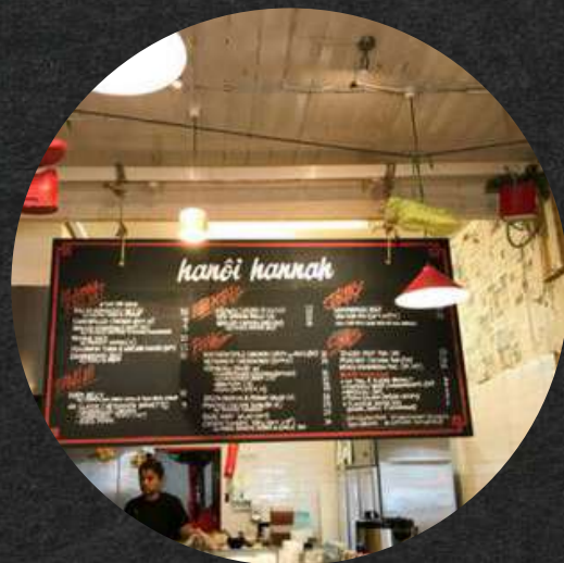
📍 Hanoi Hannah