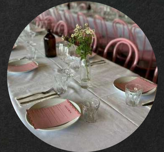
📍 Sunnyboy Beach Club