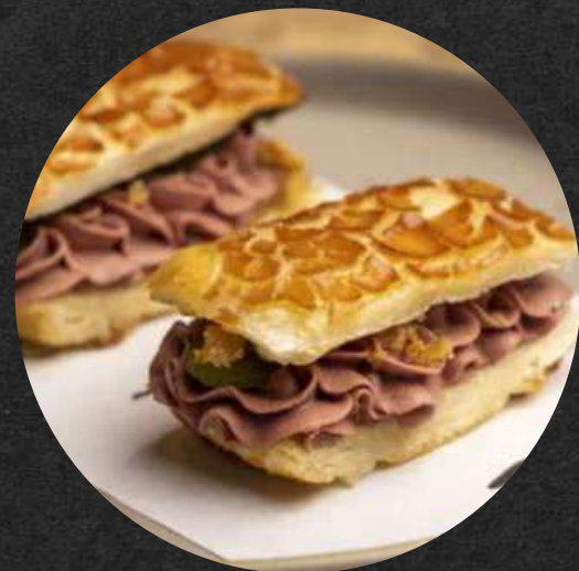
📍 New Quarter