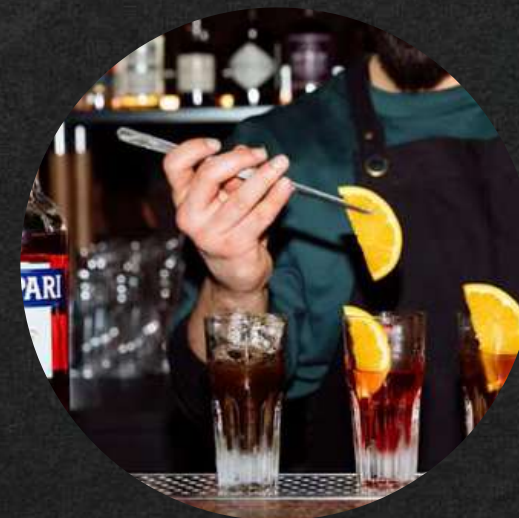
📍 Studio Amaro