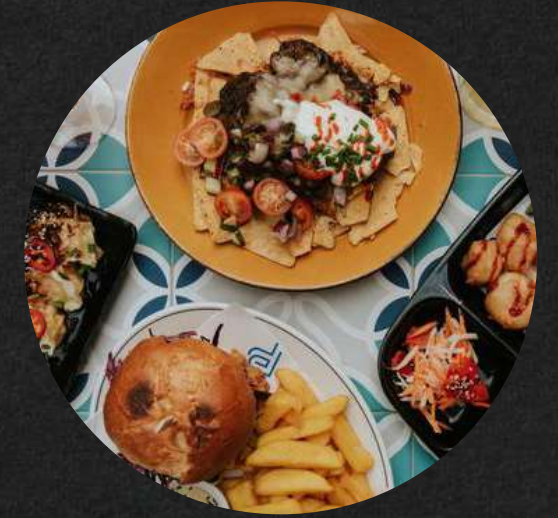
📍 Parkers Pavilion

and more business partnership with King's Career Network !