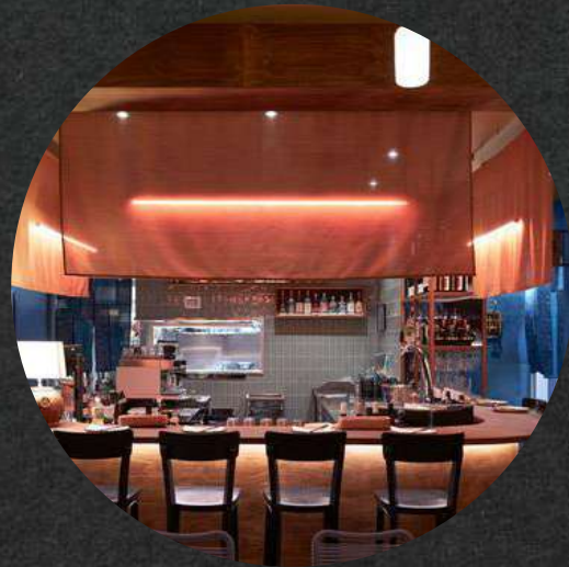
📍 Bang Bang