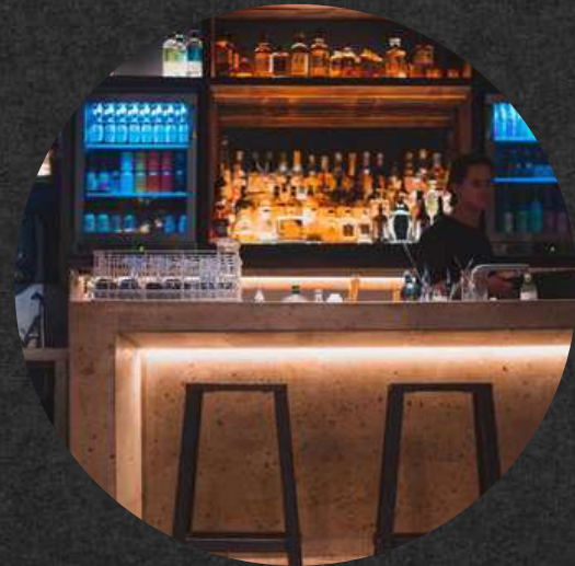
📍 Yuzu Dining