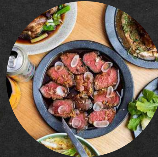
📍 Tokyo Tina